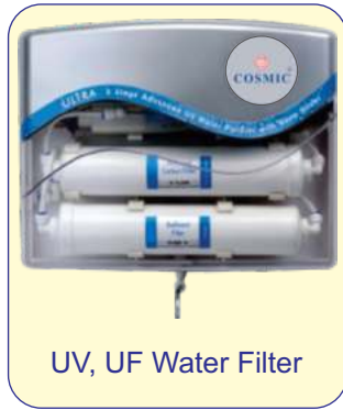
UV, UF Water Filter